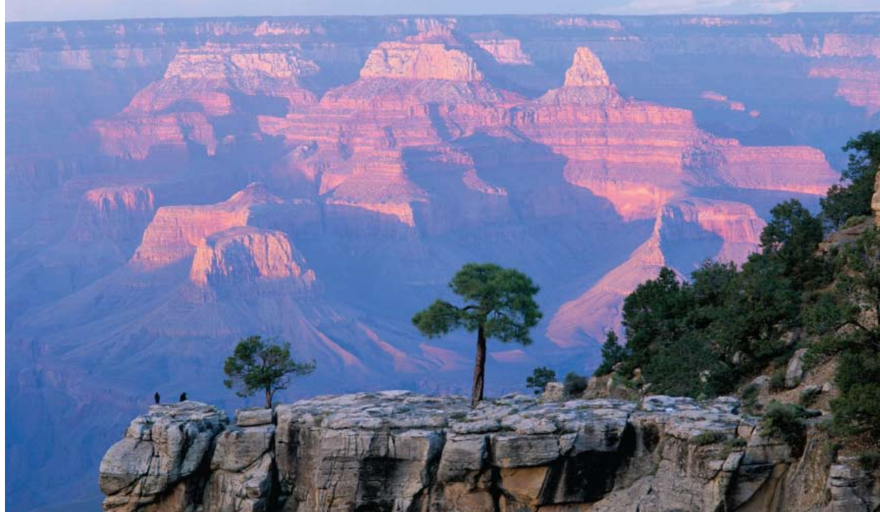
Explore the Grand Canyon