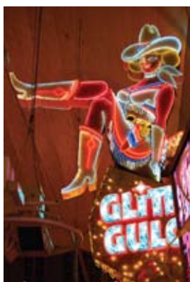
Have fun exploring the Las Vegas Strip

Luxurious, centrally located, soothing or exciting - your hotels were selected to reflect the eclectic personalities of each destination. Enjoy the city settings of the InterContinental Hotel Los Angeles, the San Diego Marriott Gaslamp Quarter and the action packed Planet Hollywood Resort & Casino in Las Vegas. Retreat to the relaxing Hilton Palm Springs and InterContinental Montelucia Resort & Spa in Scottsdale and the scenic surroundings of your National Park Lodge at the Grand Canyon.