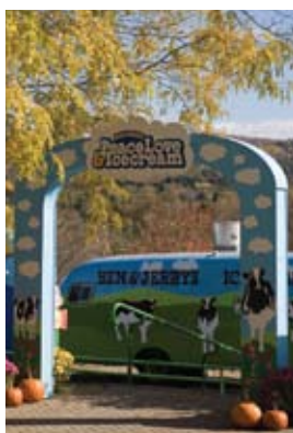
Visit Ben and Jerry's Ice Cream Factory

DAY 8 – PORTSMOUTH – DEPART BOSTON. Continue south to the charming seaside village of Rockport on Cape Ann. Stroll down flower-filled lanes lined with wooden fishing shacks, quaint stores and art galleries before heading back to Boston. Stops will be made at Boston International Airport and the tour hotel in Boston for guests wishing to extend their stay. (B) Please do not schedule flights before 4 p.m.