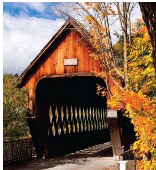
See the famous covered bridge in Woodstock