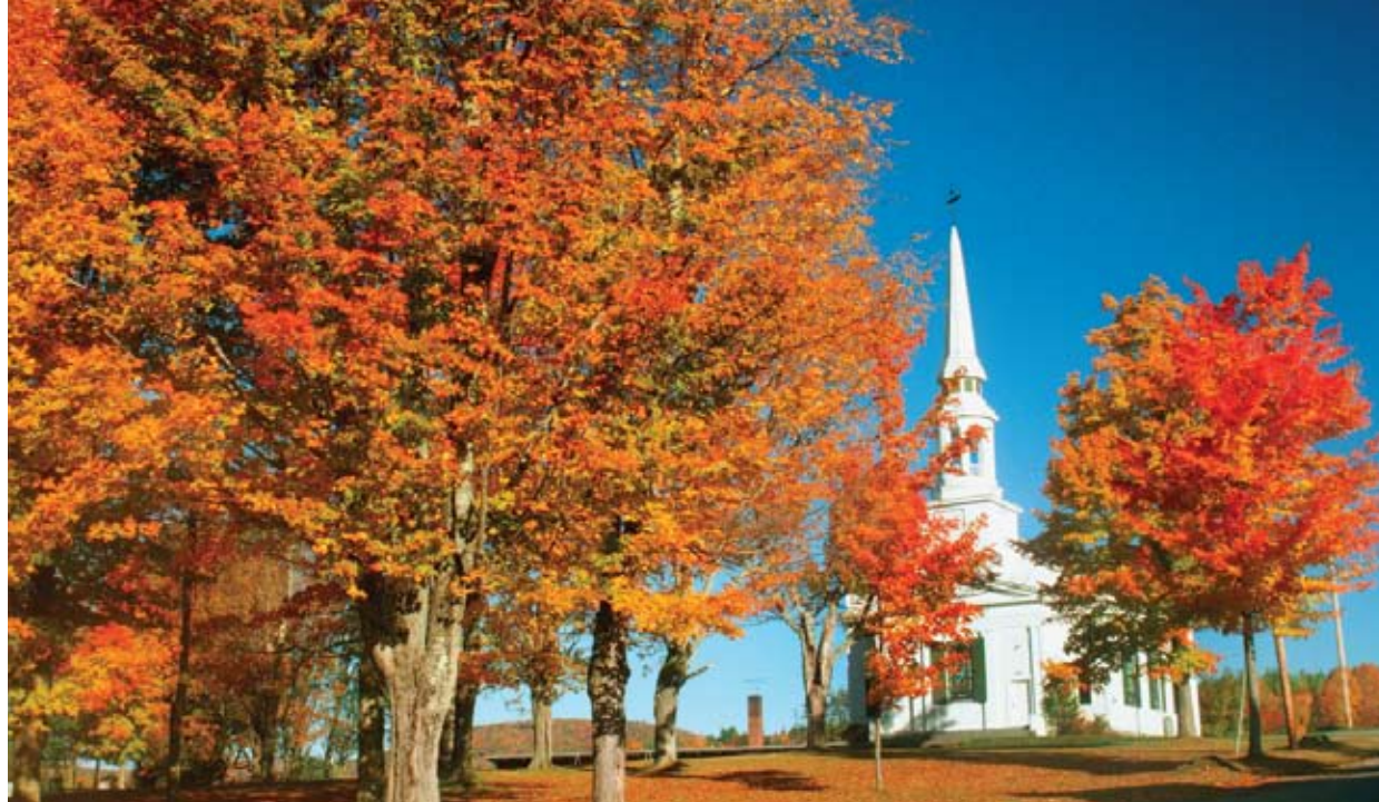
See the beautiful fall foliage in Vermont

The quintessential autumn vacation in this most picturesque corner of North America, brimming with Americana and awash with the dazzling colours of Indian Summer.