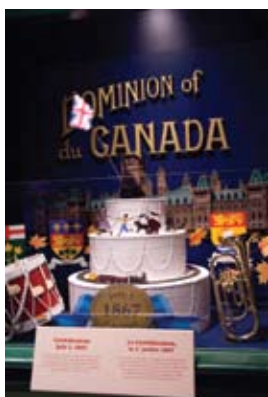
See the displays at Founder's Hall