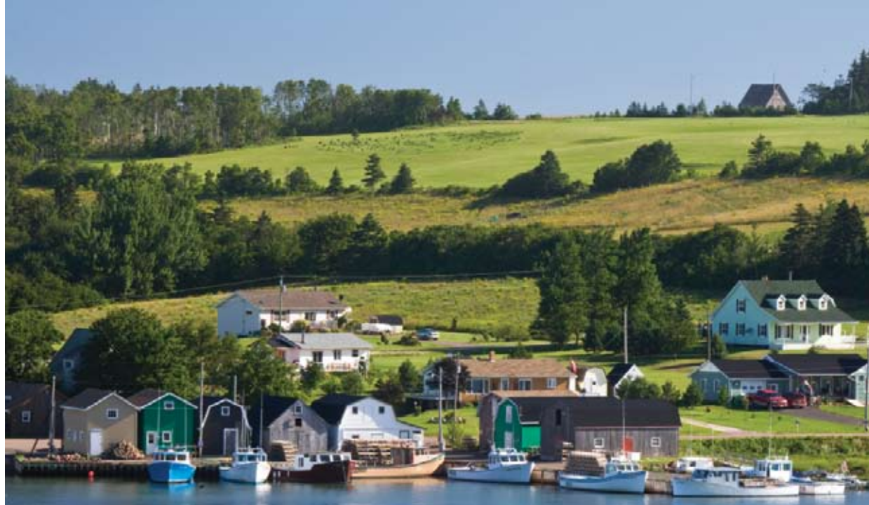
Prince Edward Island