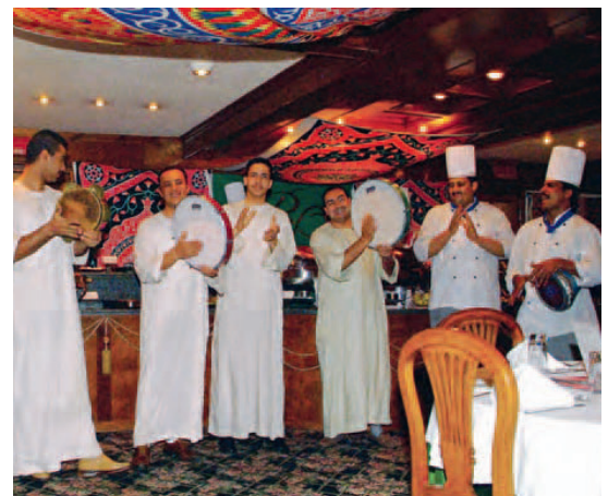
Join in the fun of a Galabea party while on your cruise