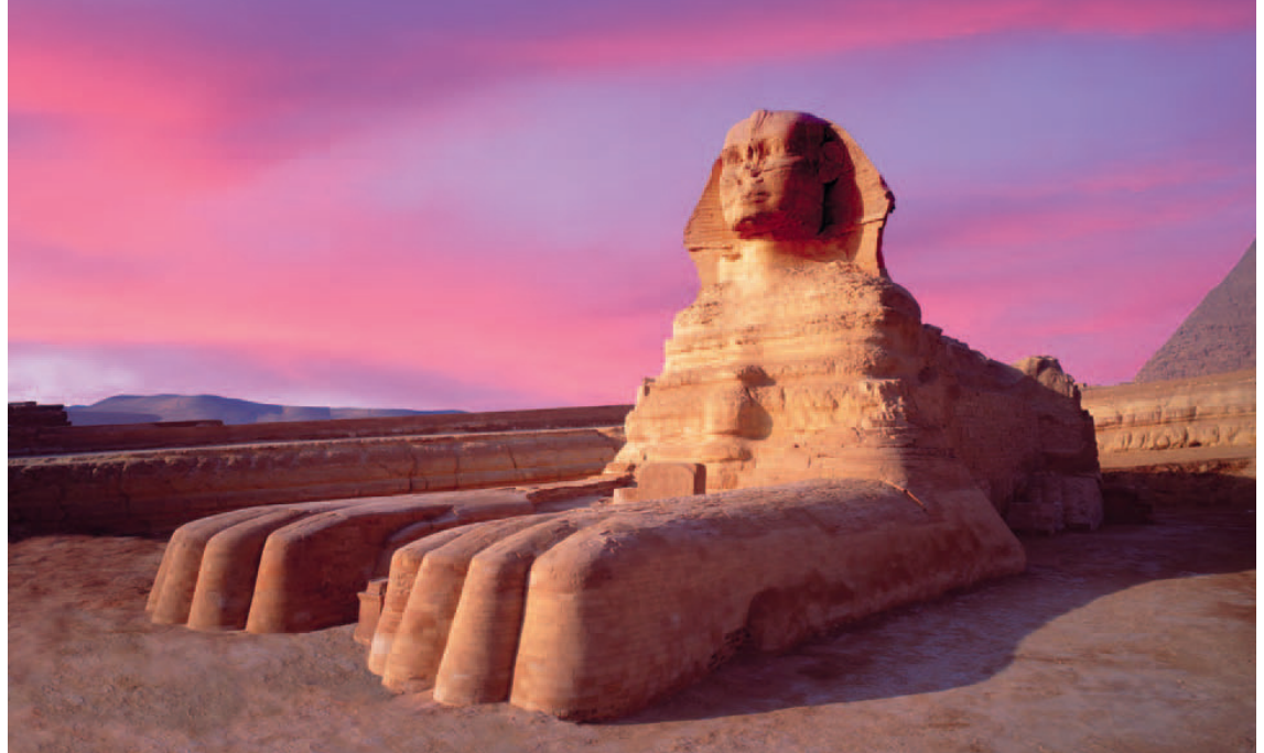
Carved from the bedrock of the Giza plateau, the Sphinx is a mysterious marvel from the days of ancient Egypt