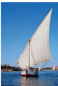
Enjoy a ride on a traditional Nile felucca

DAY 12 – DEPART CAIRO. The tour ends with transfers to Cairo airport. (BB)