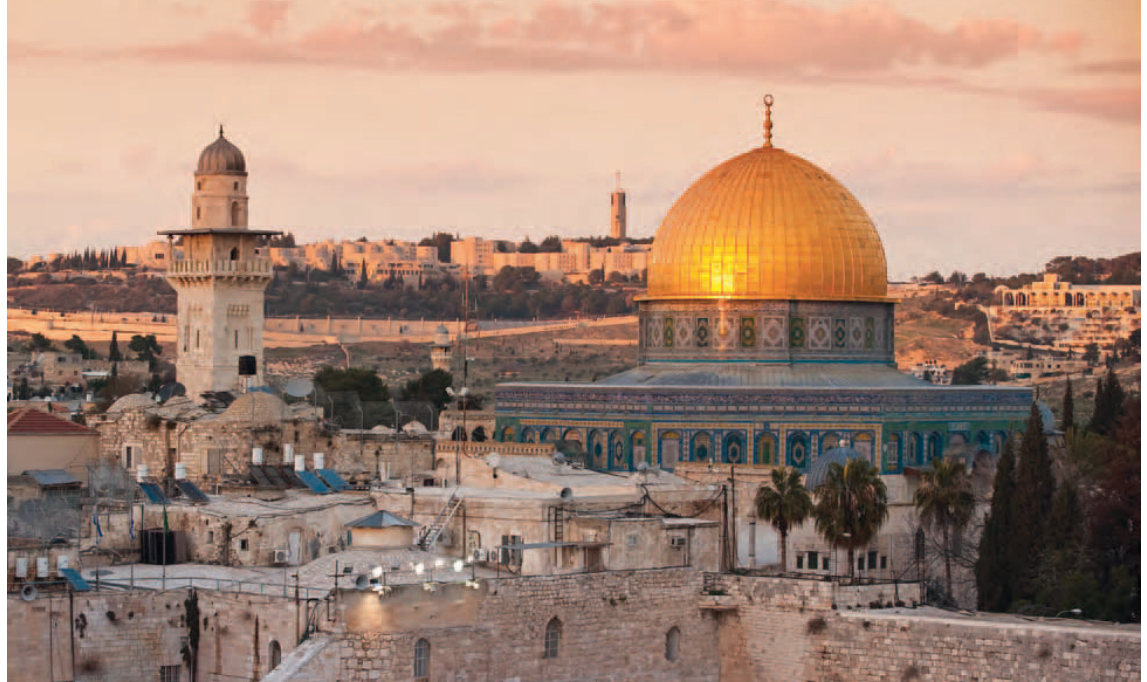
Dome of the Rock, Jerusalem

Walk in the footsteps of Jesus as you follow His life from birth to the Crucifixion. Jewish and Islamic sites, as well as some contemporary visits, balance the tour.