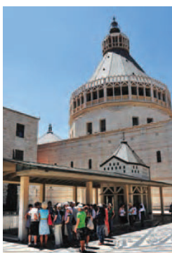
Church of the Annunciation, Nazareth

DAY 8 – DEPART JERUSALEM. The tour ends after breakfast with transfers to Ben Gurion airport. (BB)