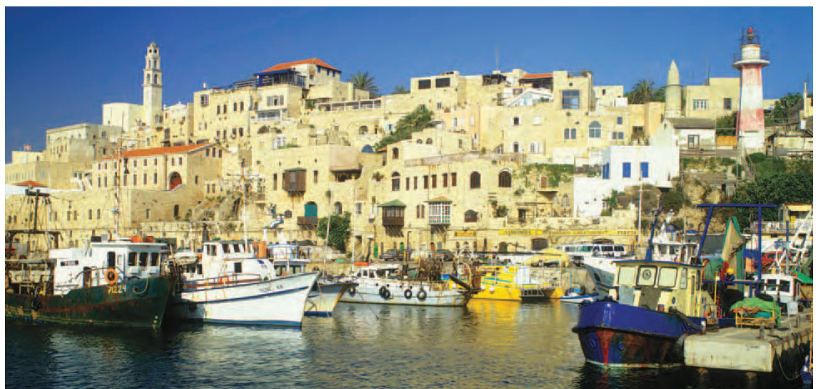
Visit the ancient port of Jaffa