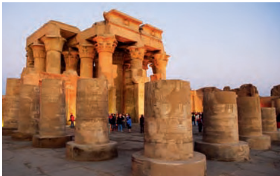
Kom Ombo Temple

Sadly, your tour comes to an end today. There are transfers to Cairo Airport for your onward flight home. (BB)