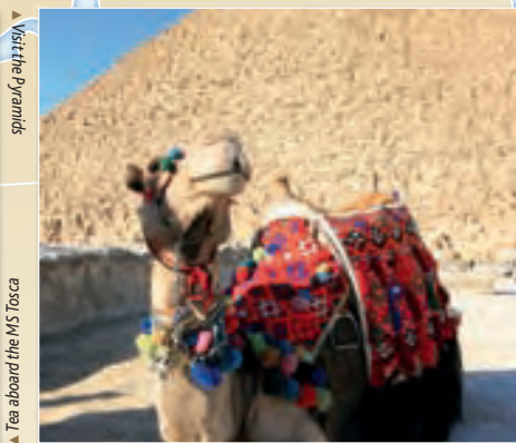
Visit the Pyramids