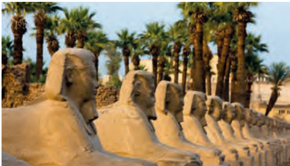
The Avenue of Sphinxes - an ancient route connecting the Luxor and Karnak temples

Your tour concludes after breakfast today. You are transferred to Cairo Airport to board your onward flights. (BB)