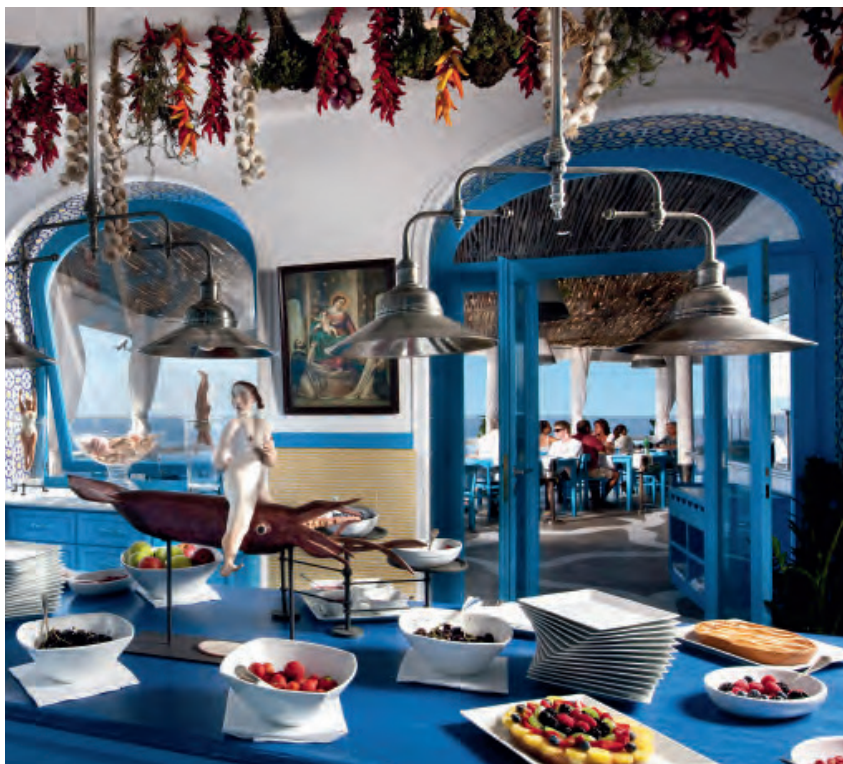
A relaxing and delightful Highlight Lunch at Il Riccio, Capri