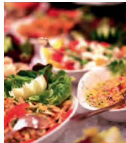
Savour delicious and authentic regional cuisine