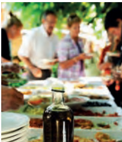
A long included Highlight Lunch in Provence