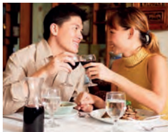
Insight's relaxed stays in each city allow time for exploration and night time dining choices

Our superb Dine-Around experiences feature small group dining in the local style at a choice of restaurants with tempting menus. Highlight Dinners may include a Roman Feast with Operetta highlights, Addressing the Haggis in Scotland, a Flamenco Spectacular in Seville, or a Galabea party on your Nile cruise.