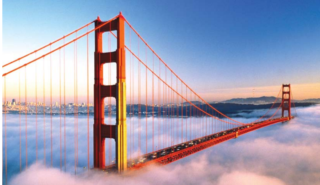
Golden Gate Bridge, San Francisco