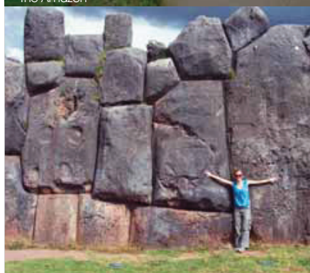
Ancient Inca ruins