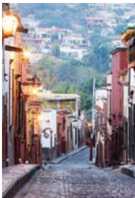
San Miguel de Allende