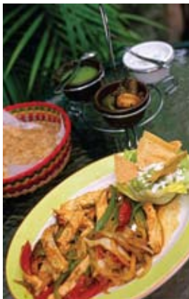
Sample some Mexican food