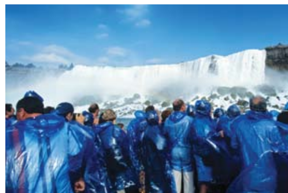
See the falls up close, aboard the Maid of the Mist