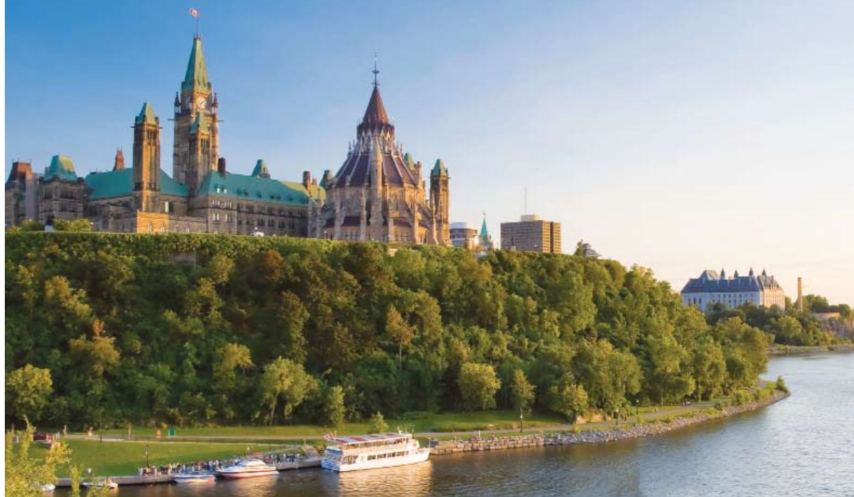
Ottawa's Parliament Hill