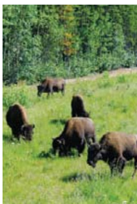
Look out for buffalo roaming free

DAY 10 – DEPART DENVER. Your tour ends with a departure transfer to Denver International Airport. For the ultimate western experience, this itinerary also forms part of America's Magnificent National Parks, and can also be combined with the Wonders of the American West on selected departure dates. (B)