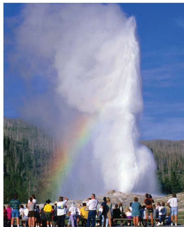
Witness Old Faithful at Yellowstone National Park