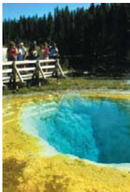
See the hot springs at Yellowstone National Park

DAY 16 – DENVER – DEPARTURE. Your vacation comes to an end today. A departure transfer to Denver International Airport is provided. (B)