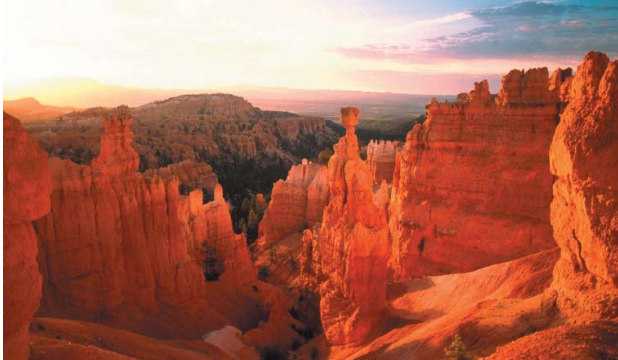
The incredible hoodoos of Bryce Canyon