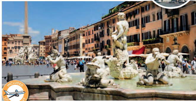
Piazza Navona - 'the living room of Rome'

DAY 1 - ARRIVE PARIS. Welcome to Paris! Insight's Airport Transfer Service departs for your tour hotel at 08:30, 11:00 & 13:30. After checking in, enjoy an afternoon orientation tour † . Tonight, join your Insight Personal Concierge for an informative meeting and Welcome Drink. Hotel: Crowne Plaza République.