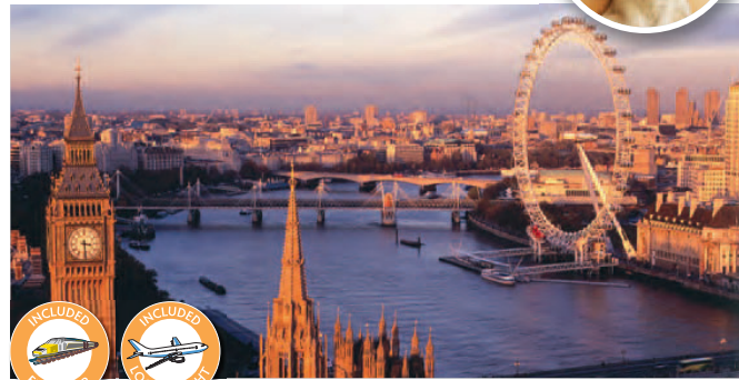
London's iconic buildings and structures line the River Thames

DAY 1 - ARRIVE LONDON. Welcome to London! After checking in to your hotel, the afternoon is yours to relax or to explore. Spend the evening at an informative meeting and enjoy a Welcome Drink with your Insight Personal Concierge. Hotel: Thistle Marble Arch.