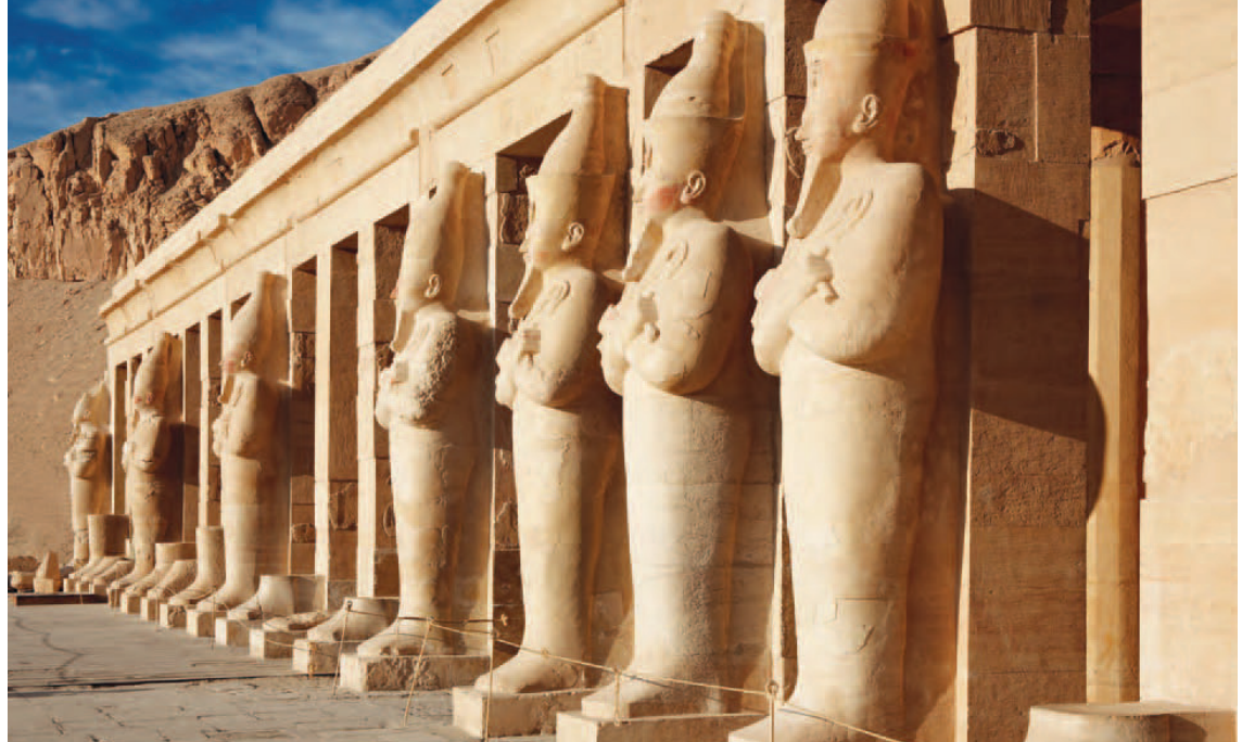
The Temple of Hatshepsut, one of only a few female Pharaohs to rule Egypt