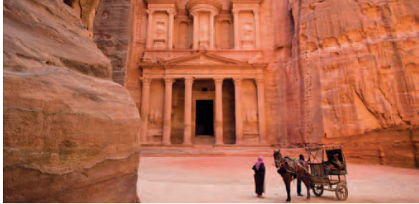
Visit Petra, the 'rose red city, half as old as time'