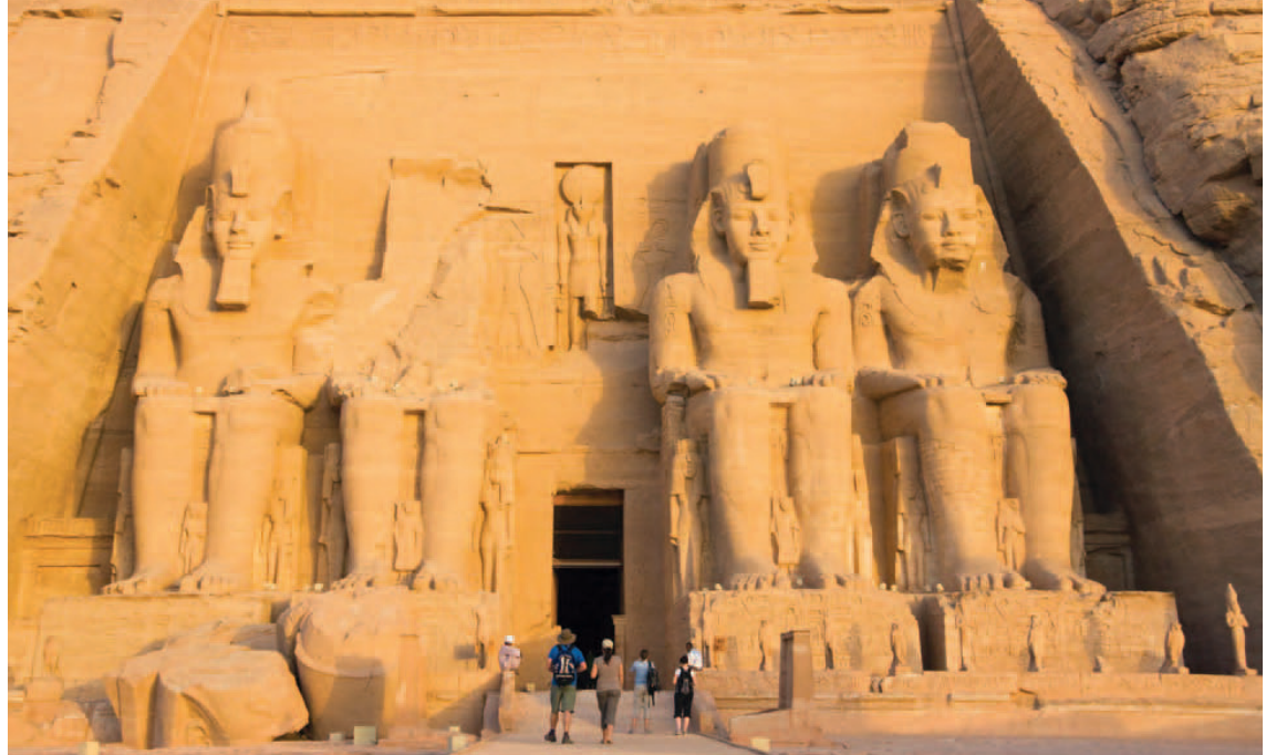
Visit the magnificent temples of Abu Simbel, amazingly repositioned in the 1960's to allow for the newly formed Lake Nasser