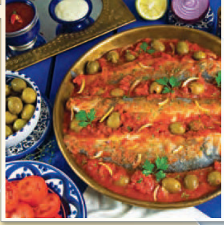
Egyptian dinner and Galabea Party

Tour the amazing temples of Rameses II Experience the temples of Abu Simbel by night at the Sound & Light Show