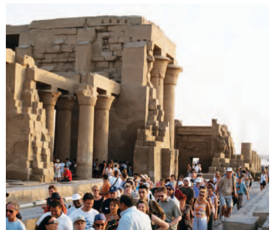
Visit the well preserved temple at Kom Ombo