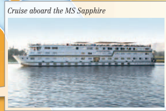
Cruise aboard the MS Sapphire

Embark on an excursion to the West bank of the Nile to visit Queen Hatshepsut's temple and the Valley of the Kings