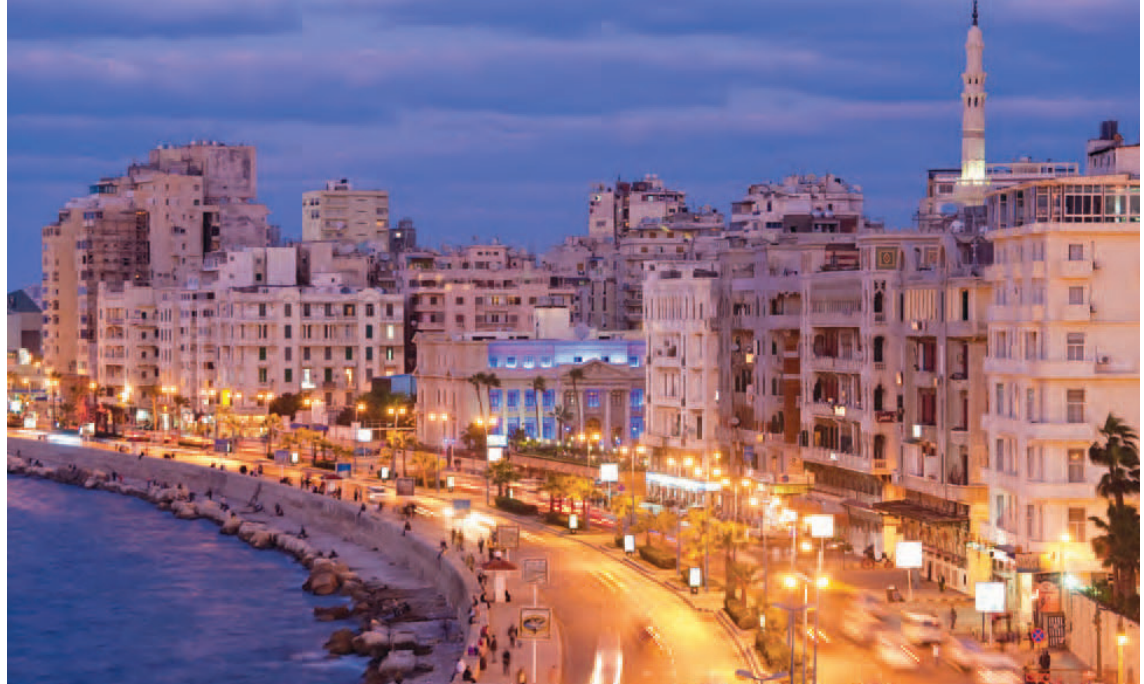
Alexandria, the pearl of the Mediterranean