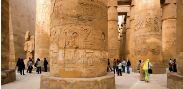
Visit Karnak's vast Hypostyle Hall