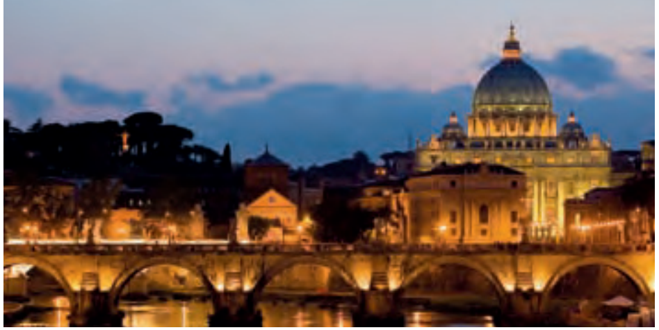
St Peters, Rome

All transfers, days 4, 7 & 10 (per itinerary)