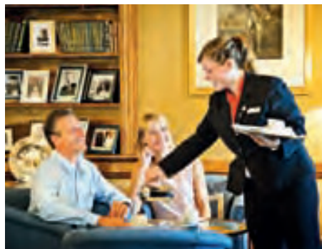
Enjoy exceptional service

Make a morning stop in the beautiful town of Baeza, acknowledged by UNESCO for its Renaissance architecture. After some free time in the historic centre, continue through the mountains to climb the Pass of Despenaperros. Descend to the flat plains of La Mancha, where Don Quixote tilted at windmills as his faithful Sancho Panza looked on. Eleven of these windmills crown the ridge above Consuegra and the sweeping views over the plains are superb. Move on to the Spanish capital and your elegant hotel located near the Prado Museum - ranked as one of the world's best hotels by Condé Nast Traveler's 2010 Gold List. Hotel: Westin Palace. (BB,D)