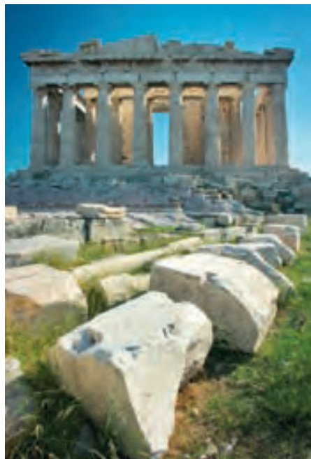
Visit the mighty Parthenon, Athens

Two full glorious days at leisure to explore the riches of Mykonos. Explore the town with its winding maze of walkways, whitewashed houses, magnificent windmills and uninhibited nightlife. Perhaps enjoy a cocktail on the waterfront at little Venice, watch the sunset at Shirley Valentine beach or swim the endless array of dazzling beaches that surround the island. Or why not take a short boat ride to Delos, the holiest island of them all and birthplace of Artemis and Apollo. (BB, BB)